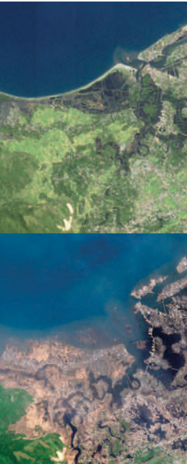
ABOVE: Western Banda Aceh. Following the tsunami almost all of the buildings in the town were destroyed along with all of the shrimp and fish ponds (tambaks). These occupied more than 35,000 hectares of former mangrove habitat.