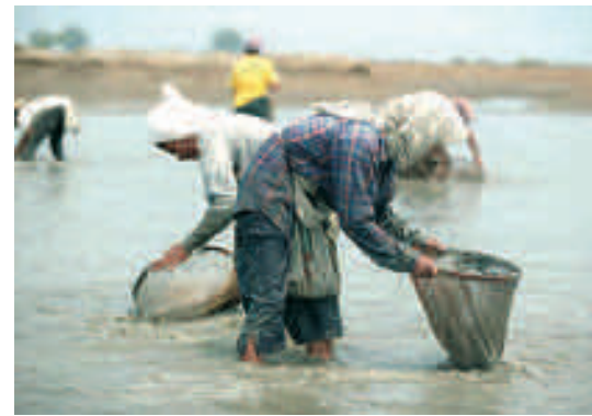
ABOVE: The tsunami damaged 20,000 hectares of shrimp farming ponds in Aceh. People have taken to catching anything they can from the few remaining ponds and canals.

Certainly, if shrimp aquaculture is to be restored, there must be improvements made. Farms must be developed and operated in a socially, economically, and environmentally responsible manner, that brings real benefits for local people. Shrimp ponds should be located in areas that are suitable for shrimp production and in ways that conserve biodiversity, ecologically sensitive habitats and ecosystem functions 91 . There should also be clear legal title to the land, which should not be located in any existing or proposed green belt, and design and reconstruction should be done in ways that do not cause off-site ecological damage, for example salinization of agricultural lands or disruption of water supplies 91 .