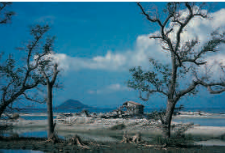
ABOVE: Degraded mangroves, Vietnam.

'In many countries and regions, mangrove deforestation is contributing to fisheries decline, degradation of clean water supplies, salinization of coastal soils, erosion, and land subsidence, as well as release of carbon dioxide into the atmosphere.'