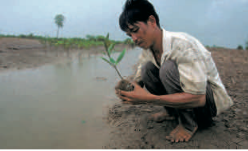
LEFT: Mangrove restoration and replanting schemes are now underway in countries across south-east Asia.