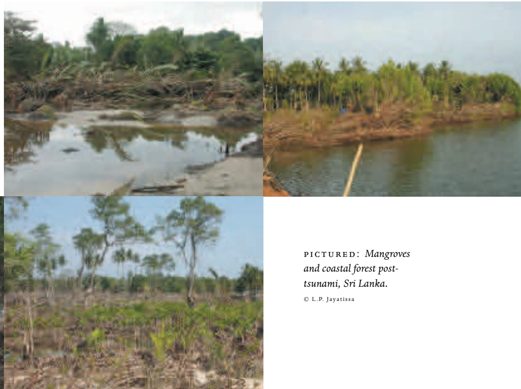
PICTURED: Mangroves and coastal forest post-tsunami, Sri Lanka.