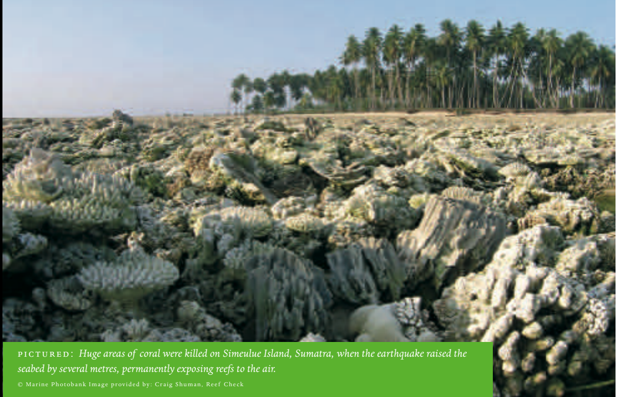
PICTURED: Huge areas of coral were killed on Simeulue Island, Sumatra, when the earthquake raised the seabed by several metres, permanently exposing reefs to the air.